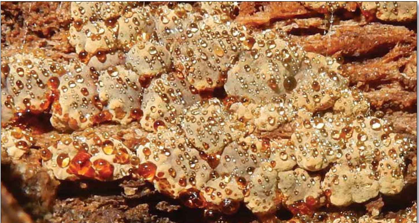
Figure 6. Immature early stage of cushion-shaped frustules with clear guttation droplets covering most of surface area with fewer amber-colored droplets at left margin, May 1, 2016.

Figures 6–8. Stages of Xylobolus frustulatus fruiting bodies.