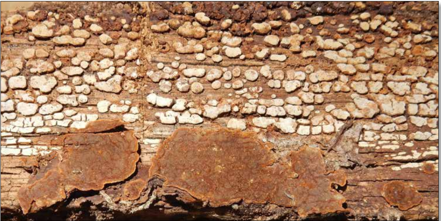
Figure 5. Stereum rugosum growing (below) with Xylobolus (above) on the same decayed post oak log, February 19, 2017.

Figures 6–8. Stages of Xylobolus frustulatus fruiting bodies.