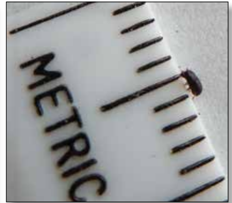
Figure 9. Adult male beetle walking on edge of ruler slightly larger than 1 mm.

(Version 6). Stacking was done using Helicon Focus. Macrophotography was done using a Nikon Cool-Pix S9900 camera. Fungal fragments were embedded in paraffin and 4- \mu m sections stained with Gomori-methenamine silver, hematoxylin and eosin, and by the periodic acid Schiff method. Sections were examined and photographed at 1000X with an Olympus microscope.