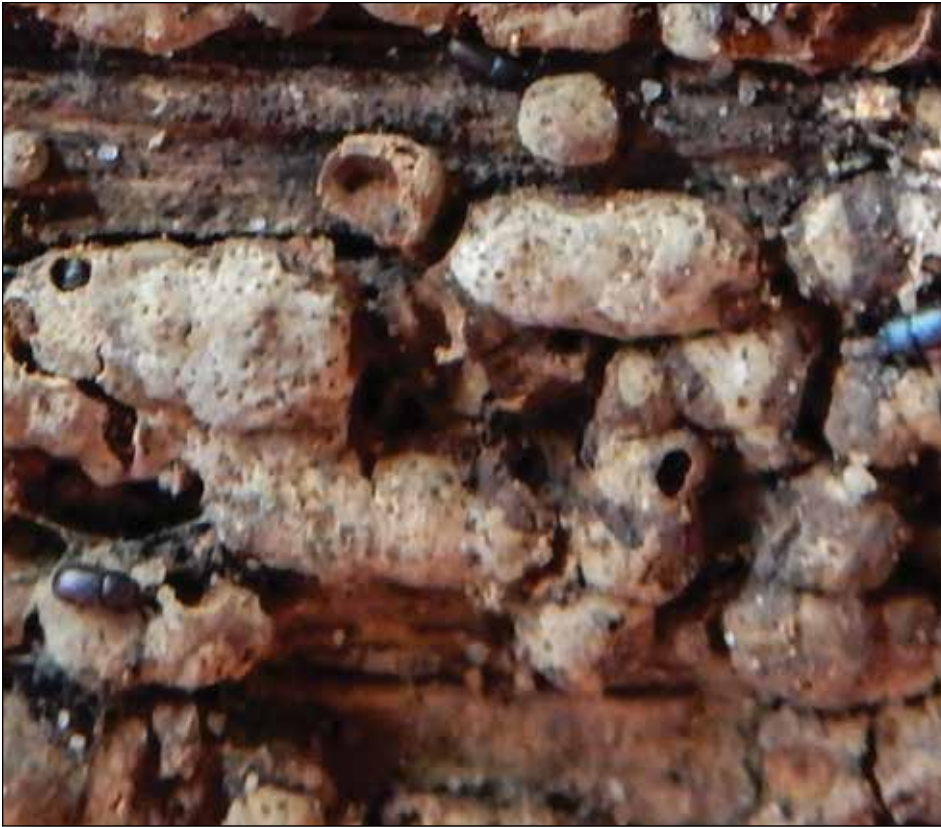
Figure 10. Mature Xylobolus frustules inhabited by Cis beetles. Note spherical hole where the beetle lives (upper left) and how feeding activities alter fruiting body shape. Two beetles outside of frustules showing fractured and empty frustule remains after heavy feeding by beetles, December 24, 2016.

biological function. It is unlikely that they are involved in spore dispersal as they are usually present prior to spore maturation.