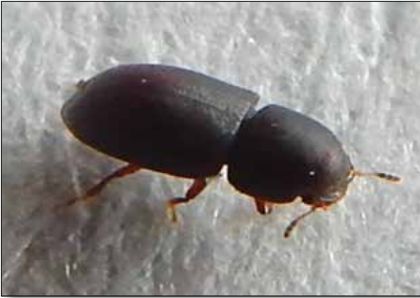
Figure 11. Adult female beetle walking on background.

fruiting body stages in many fungi. This kind of dedicated field work often results in surprise discoveries of ecological interactions (the life cycle of a new species of tree beetle) not possible on a hit and miss basis dictated by rainy weather and convenience of the collector's schedule. Xylobolus frustulatus is part of a complex local ecosystem, including a variety of insects, responsible for the recycling of dead wood. The interrelationships of this life cycle await further research to elucidate the fungal-invertebrate complex interactions with dead wood and recycling of decomposing organic matter on ground sites.