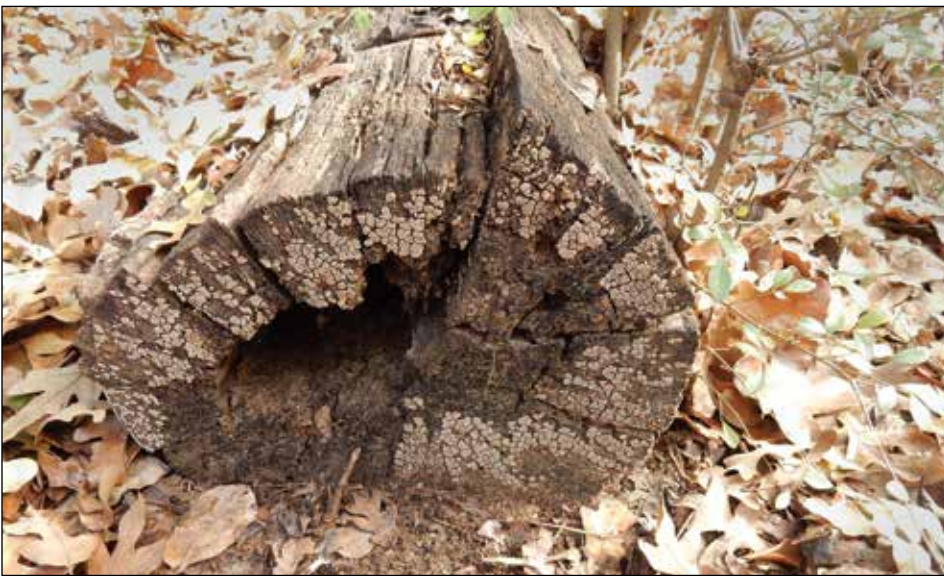
Figure 3. Cut end of log showing fungus on outer portion and inner rotted center with no fungi growing in the hollow dark interior, December 21, 2016.