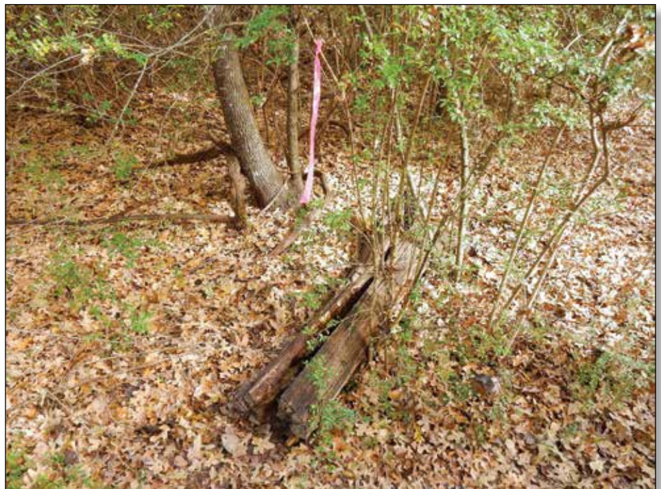
Figure 1. Ground site habitat with fungus on 6-ft log mostly on top of leaves, January 21, 2017.

Figures 1–4. Habit photographs of Xylobolus frustulatus from Greer Island, Fort Worth Nature Center and Refuge on decorticated post oak logs.