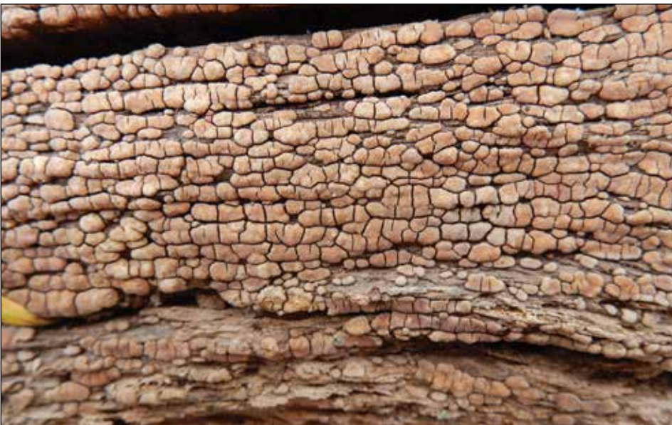
Figure 4. Log with weathered frustules, May 22, 2016.

that produces characteristic reddish liquid droplets (Bunyard, 2017). Others have photographed similar droplets on immature specimens of Xylobolus (Smith, 2016).