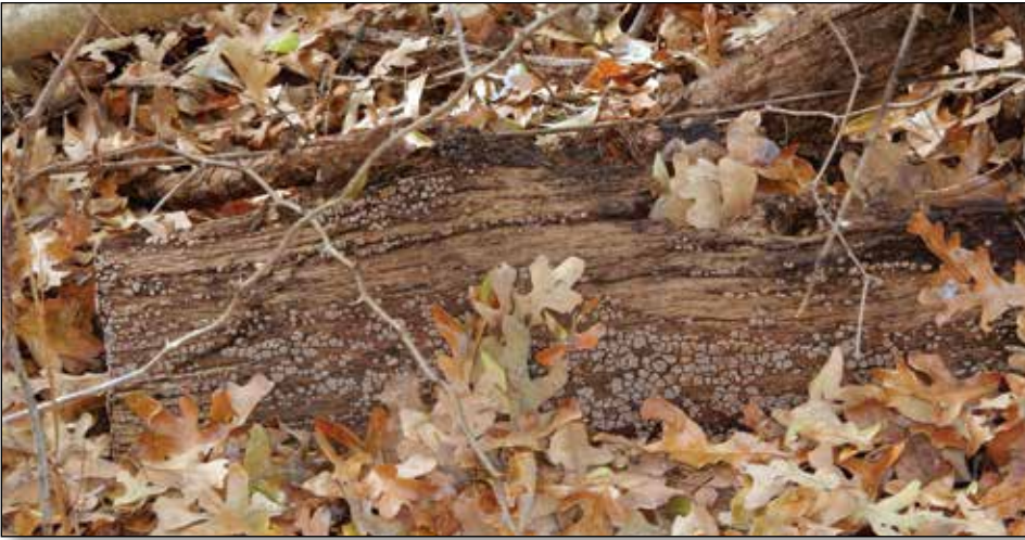
Figure 2. Log partially buried in leaves. Note the lobed cross-shaped oak leaves resembling a Maltese cross, December 21, 2016.