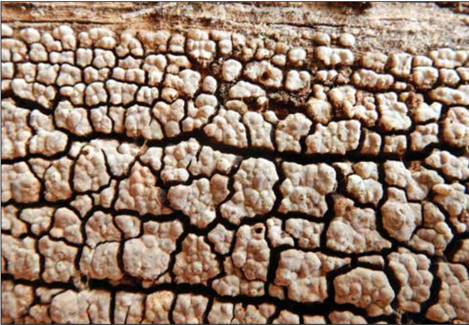
Figure 7. Mature frustules showing polygonal, flattened, ivory-colored frustules of varying sizes with margins separated by black spaces, December 21, 2016.